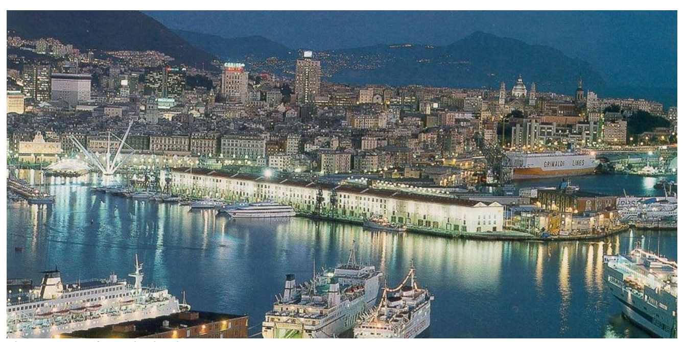
The city seen from the harbour

In this city, languages and cultures have always mixed in the centuries, since the time of the Crusades, making it a melting pot "ante litteram". The influences, that range from Portuguese and Spanish into Turkish and Arabic, are recognizable in the spoken dialect. Just walking under the arcades of Sottoripa you can found some of the old smells from the shops that churn out "farinate" and fried fish served in paper, just as two centuries ago. With a few steps the visitor passes through historic places restored and arrives to modernity with major urban renewal made in the last decade: on one side Via San Lorenzo, Palazzo Ducale and the splendid Via Garibaldi, rich in museums, on the other one the Porto Antico with the Acquario (the largest exhibition of biodiversity in a European aquarium) and the many linked attractions.